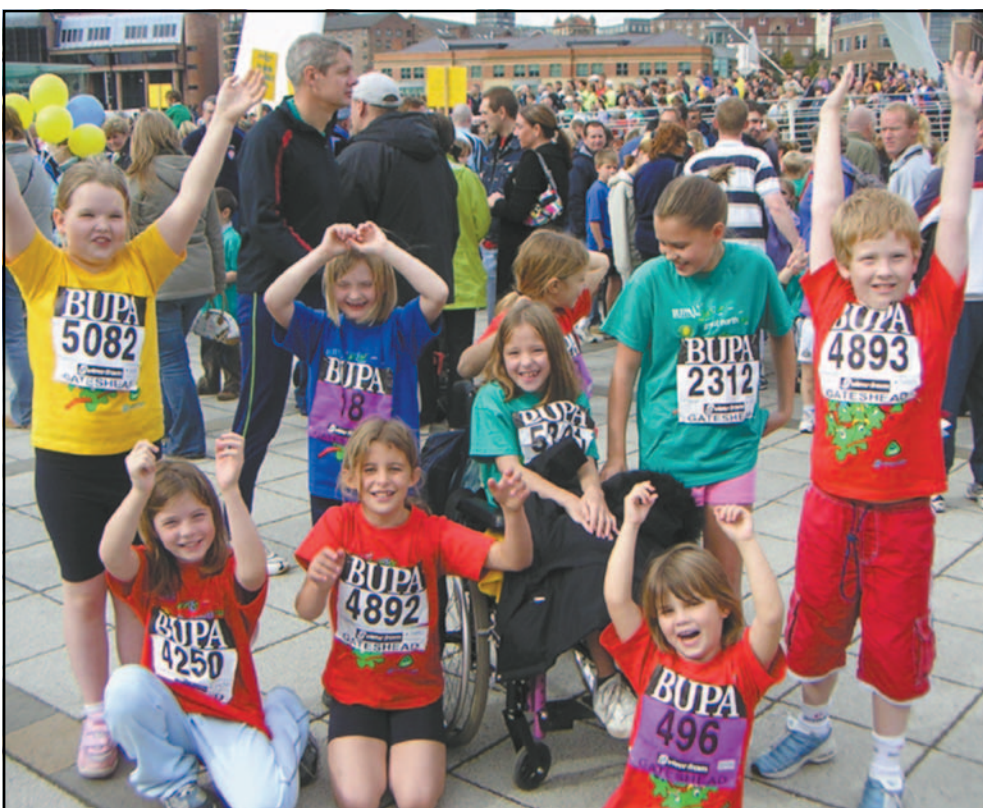
FINISHED: Junior Great North Run 2004