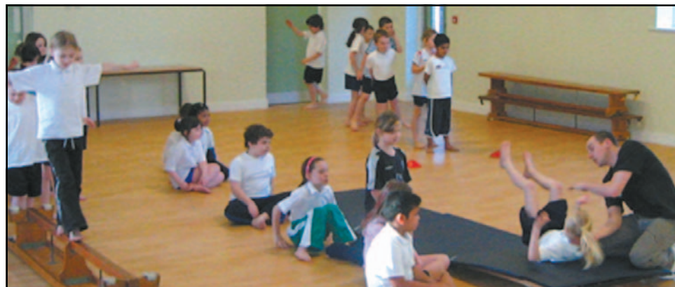
GYMNASTS: In the making

In January 2007 the school opened a brand new hall which will be used to enrich the curriculum in sport, music and drama. The school is looking at ways in which it can extend these facilities to the local community.