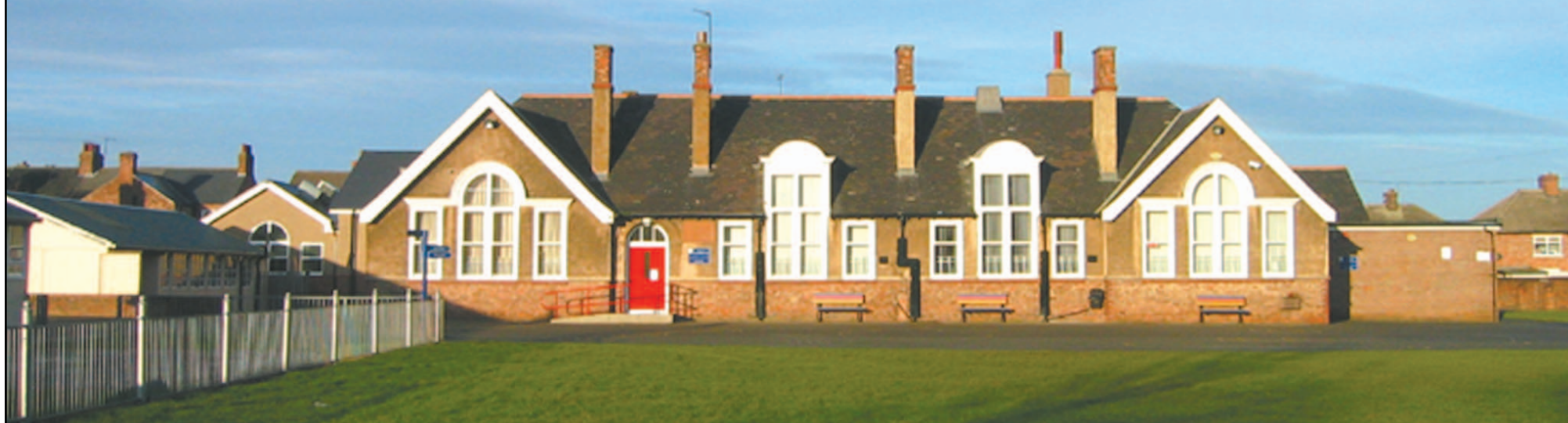
PRESTON PRIMARY SCHOOL: As it is today